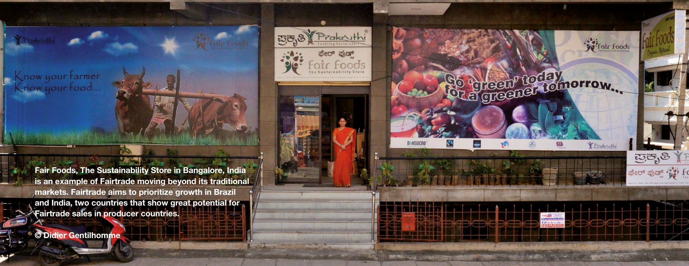
Fair Foods, The Sustainability Store in Bangalore, India is an example of Fairtrade moving beyond its traditional markets. Fairtrade aims to prioritize growth in Brazil and India, two countries that show great potential for Fairtrade sales in producer countries.